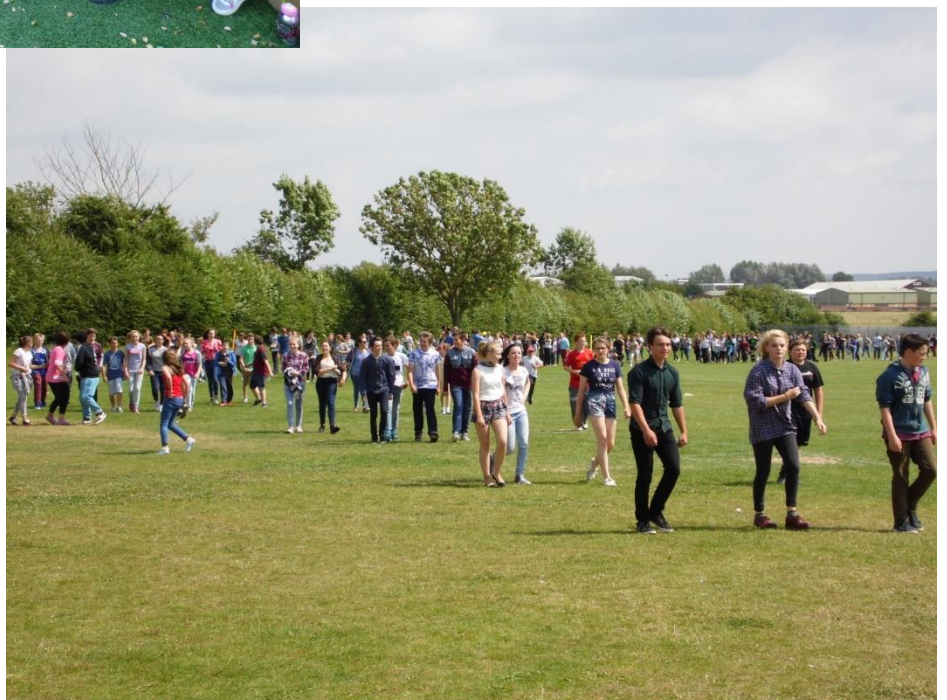
Pictured right; the Big Walk on Sir Graham Balfour school field

As a school we are extremely grateful for the support our Primary Schools give to our Cambodia fundraising and we will continue to work closely with them in the new academic year.