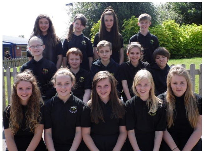
Pictured above: Year 7 Effort and Progress winners.