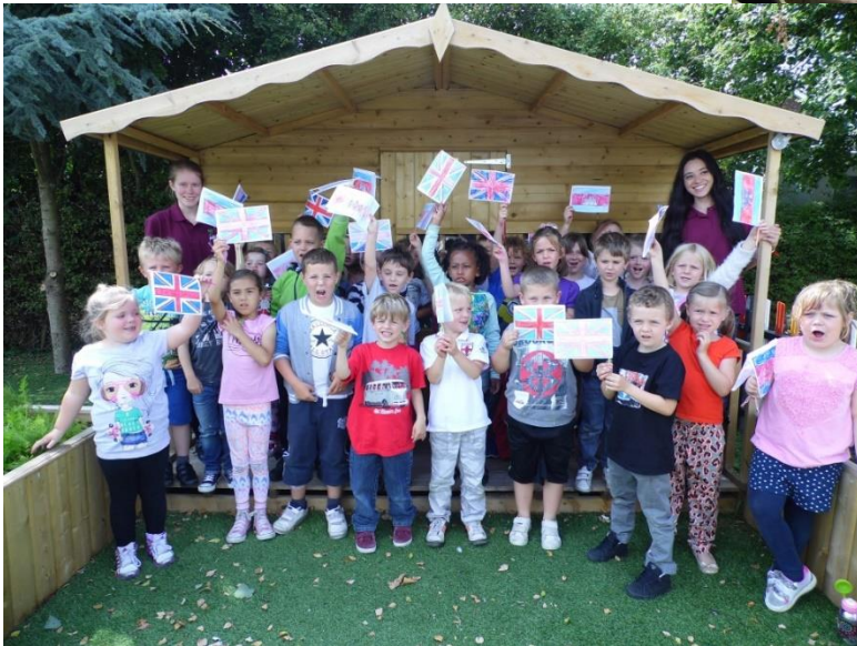
Pictured above; Year 1 Parkside pupils with their Cambodian and English flags

As a school we are extremely grateful for the support our Primary Schools give to our Cambodia fundraising and we will continue to work closely with them in the new academic year.