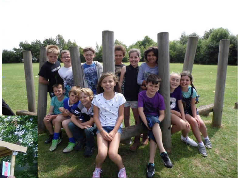
Pictured above; Year 4 Parkside pupils getting ready for their 'Big Walk'.

Our annual Big Walk for Cambodia took place after lunch on Wednesday 9 th July and for the second year running we were supported by Parkside Primary School. Years 5 and 6 joined our students to walk around the SGB school field, whilst the younger years remained at Parkside and completed circuits of their field. In addition Parkside students had spent the day taking part in Cambodian themed activities. Thank you to our 6 th form students who volunteered to spend the day at Parkside helping the children.