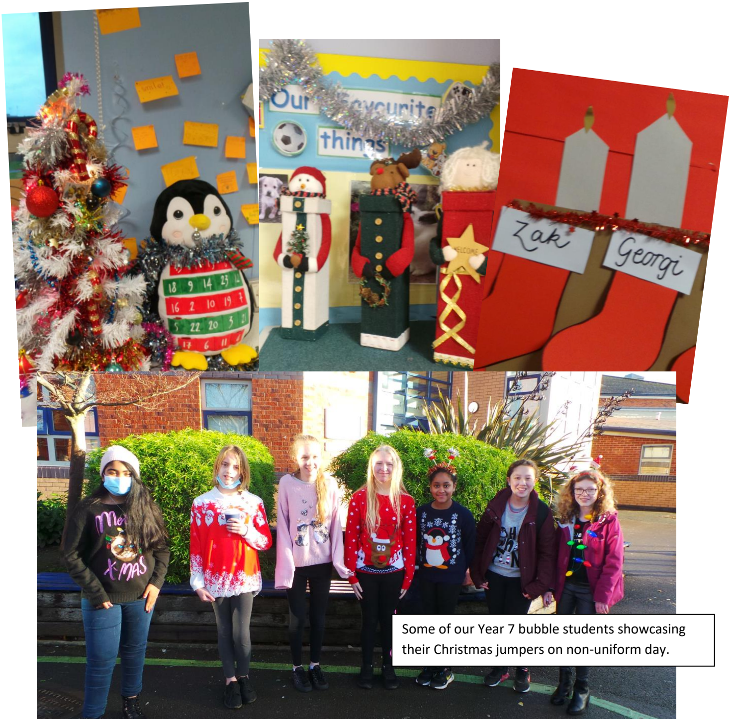
Some of our Year 7 bubble students showcasing their Christmas jumpers on non-uniform day.

To bring the term to an end we decided to hold a non-uniform day in aid of Sir Graham Balfour, Cambodia on Thursday 17th December, which raised over £700. The theme was 'Christmas Sparkle'. So, we asked everyone to bring on the sequins, put on their fabulous Christmas jumpers or maybe a Santa hat. We wanted to see lots of bling in aid of this very worthy cause.