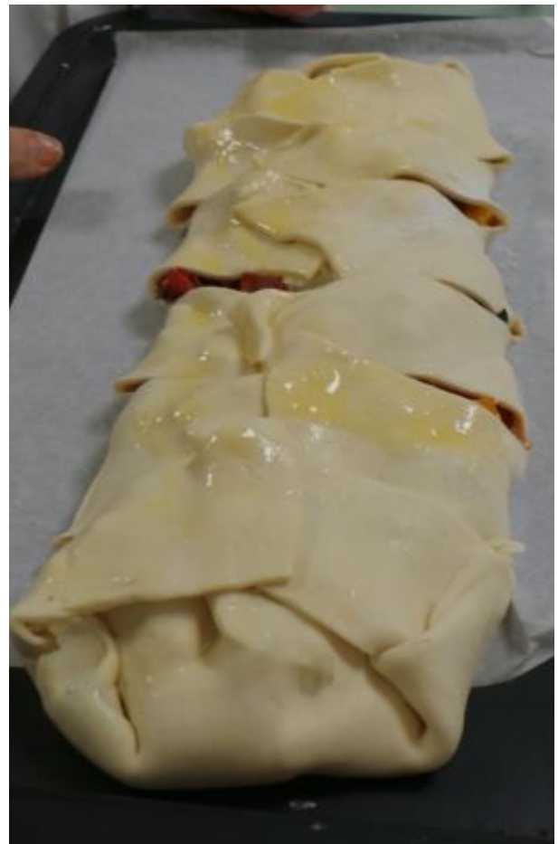
Year 10 – Goats Cheese and Vegetable Plait & Phoebe R